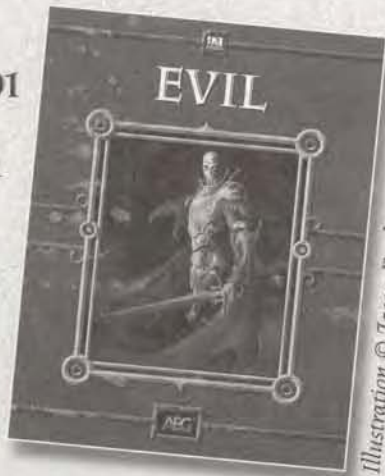
Illustration © Jason Engle

Who said you had to play the good guys? Being evil just got easier. This d20 system sourcebook has everything you need to run evil characters, develop evil campaigns, and make your nasty NPCs just a little bit nastier. Evil has rules for new prestige classes, new spells, new clerical domains, and demon summoning. If you're playing good after this book is out, you're on the wrong side of the game. 128 Pages, soft cover.